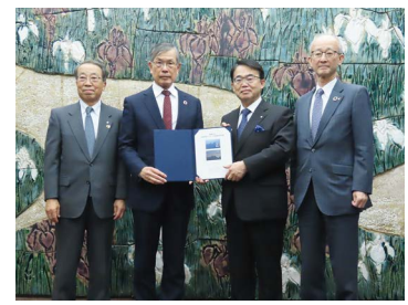
Recommendations on the construction of a hydrogen supply chain were developed to request the cooperation of municipalities, and a promotion council was established and reorganized as a result.

As a participant in the Central Japan Hydrogen and Ammonia Social Implementation Promotion Council, which consists of local municipalities and companies, Chukeiren devised the Central Japan Hydrogen and Ammonia Supply Chain Vision in March 2023. Central Japan is an industrial hub that contains a large number of companies, specialists in industries from manufacturing to logistics. Chukeiren will support them by working to help implement a large-scale hydrogen and ammonia supply chain ahead of other regions in Japan, in cooperation with industry, academia, and government.