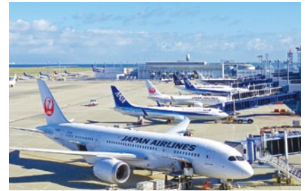
Chubu Centrair International Airport, a gateway to Central Japan

construction of a second runway from the perspective of responding to future demand for flights, realizing full 24-hour operation, handling large-scale runway repairs, and securing backup functions in the event of a disaster, as well as other perspectives. In December 2021, a concept for the future of Centrair was compiled in the Chubu Centrair International Airport Future Concept Promotion Adjustment Council organized with local governments and other organizations. For the second runway, the concept is to develop a new runway in two stages, with a current taxiway being repurposed in the first stage and the new runway being developed on newly constructed landfill in the future. Chukeiren also supports efforts to expand the use of Centrair.