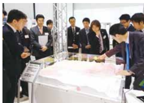
Study tour of the Disaster Mitigation Research Building of Nagoya University

The fight against global warming and other global efforts to protect our environment has grown more critical in recent years. Chukeiren watches the trends in national energy and environmental policies closely and publishes its opinions and recommendations, as appropriate, which satisfy needs for both environmental protection and economic growth.