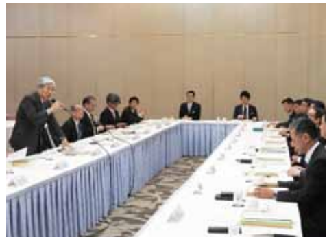
Regional Industry Vitalization Committee (Mie)

To achieve this goal, Chukeiren encourages dialogue that takes place in various parts of Central Japan – such as the Regional Industry Vitalization Committee and round-table conferences by regional members – and liaises committees of different domains. Chukeiren also executes various efforts for stronger wide-area collaborations. Some such examples are making recommendations and requests in the business succession of SMEs, regulatory and systemic reforms, IT-based productivity enhancement, and promotion of traditional crafts in cooperation with producers and relevant parties.