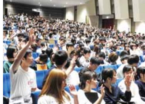
Dispatched instructor lectures in a freshman class at a member university

In addition, Chukeiren conducts surveys and studies in subjects such as the diversity in human resources and the reformation in working practices to meet the needs of a depopulating society.