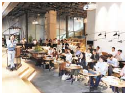
“Beyond the Border”, a training program for developing innovative human resources

Offering various events and programs throughout the year, Chukeiren aims to make Innovator’s Garage a platform which energizes and accelerates innovation in Central Japan.