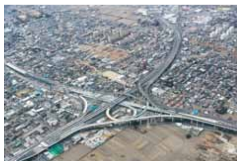
Nagoya West JCT Construction Site, Nagoya Ring Road No. 2