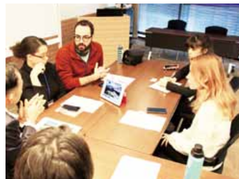
International students exchanging opinions on how to attract inbound tourists

Acting as a DMO, the Central Japan Tourism Association (CEO: Chairman of Chukeiren) supports activities to vitalize the tourism industry and local economies in 9 prefectures in the Chubu and Hokuriku Regions. Chukeiren supports Central Japan Tourism Association in their marketing-based strategic promotional activities and efforts to refine resources in the region. This is how Chukeiren extends its efforts beyond administrative boundaries and helps stimulate local tourism.