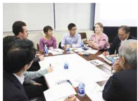
Discussion with international students on how to make Central Japan more attractive

In our role as a liaison for foreign diplomatic offices, international related organizations, etc., Chukeiren makes efforts to conduct public relations activities to promote the attractiveness of Central Japan and to promote information exchange and enhance collaboration with foreign countries.