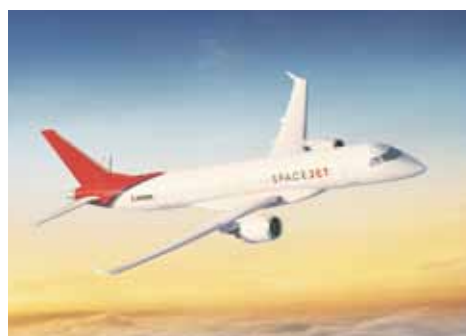
Mitsubishi SpaceJet Family