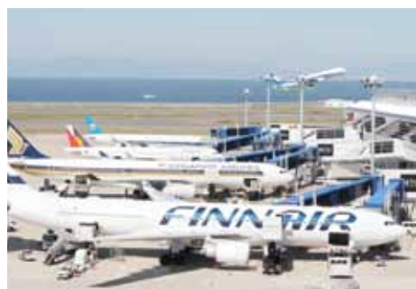
With the opening of a new terminal for LCCs, Chubu Centrair International Airport anticipates increased growth in demand

It is essential to improve road networks for logistics and tourism, as well as for serious disasters such as Nankai Trough earthquakes. In addition to arterial high-standard highways, Chukeiren is working on promoting improvement of local high-standard highways.