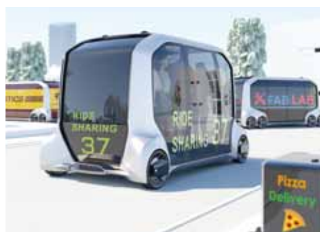
e-Palette concept electric vehicle

Home to the largest number of companies in Japan's aerospace industry, Central Japan is working toward becoming a global center of the aerospace industry. Chukeiren has established its vision for the future of the aerospace industry and helps the region's effort by advocating for the development of necessary social systems, the establishment of competitive production systems, the development of human resources with high expertise, and more.