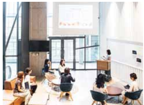
Nagoya Innovator’s Garage